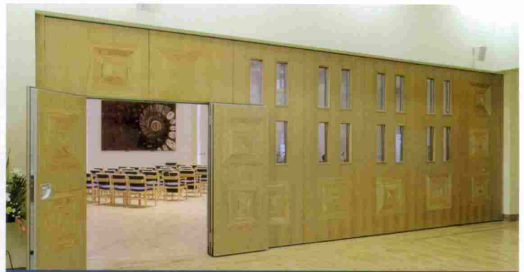
Dividers Modernfold – for its installation at St Thomas' and St Luke's Church, Birmingham