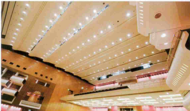
Clark & Fenn Skanska – for its contract at the Royal Festival Hall, London